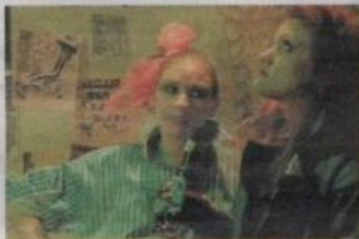
"89 GATOR MINE"